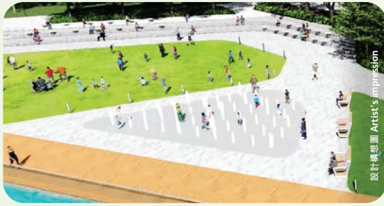
嬉水廣場 Water Play Plaza