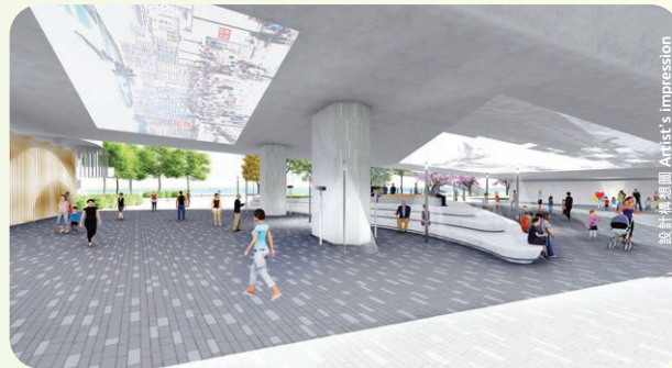
多用途活動空間 Multi-purpose and Seating Areas