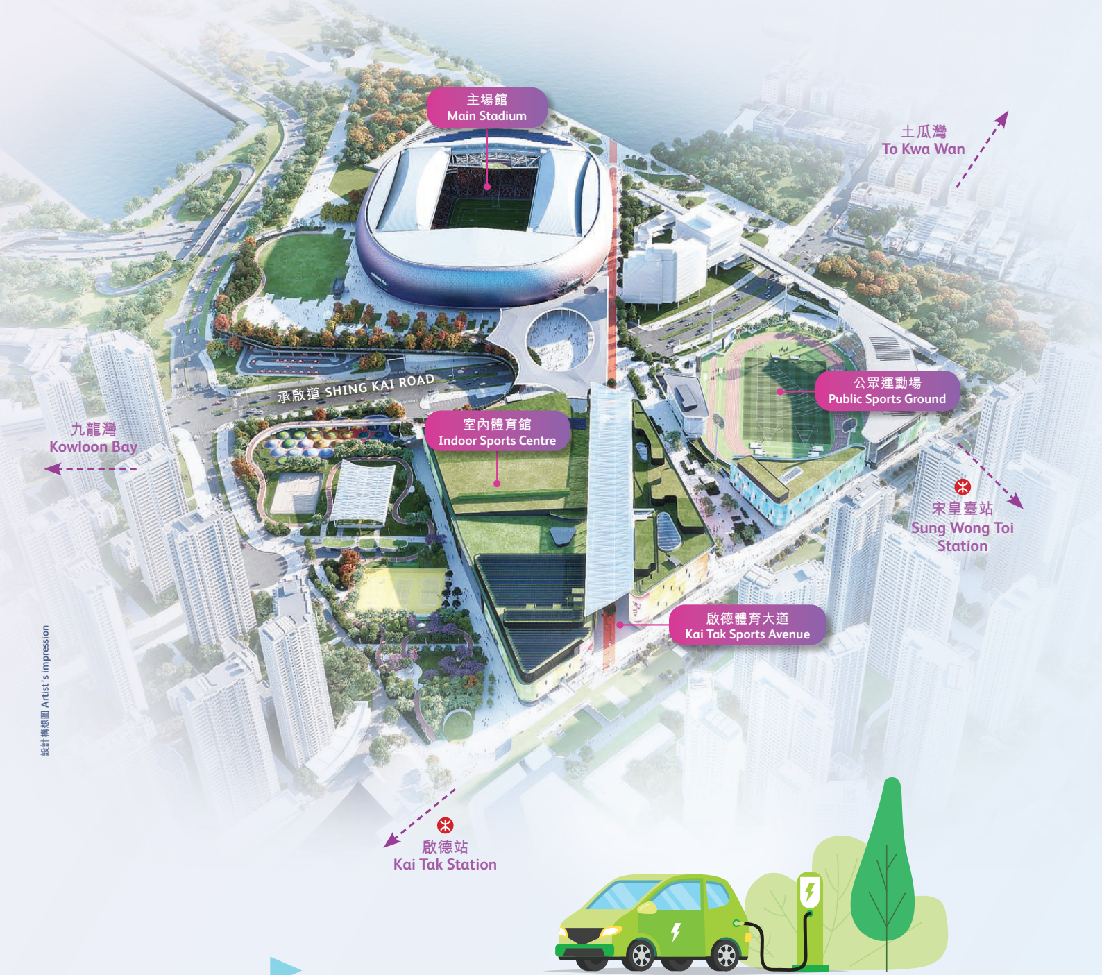
設計構想圖 Artist's impression